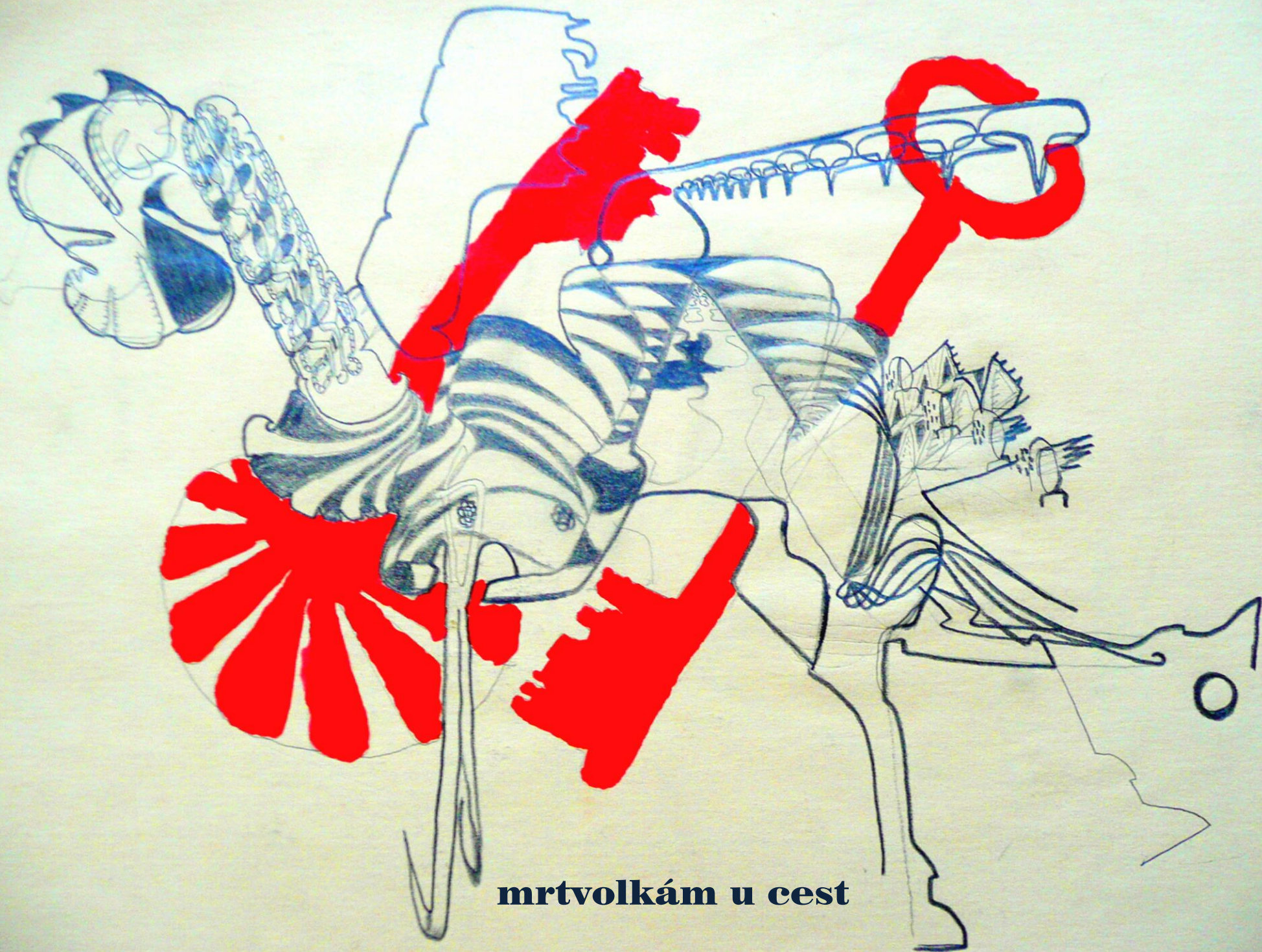
mrtvolkám u cest